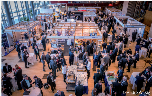
Exhibition area on IFK 2016

In order to become an exhibitor , contact exhibition@ifk-dresden.de