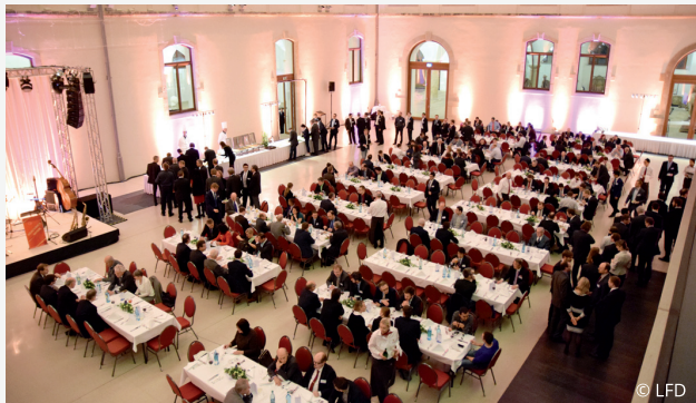
Conference banquet at Albertinum

Social events complete the setting on all three evenings. Those will take place against a backdrop of the old city center of Dresden and in research facilities of the organizing institute. A perfect place for busy networking or enjoying time amongst peers!